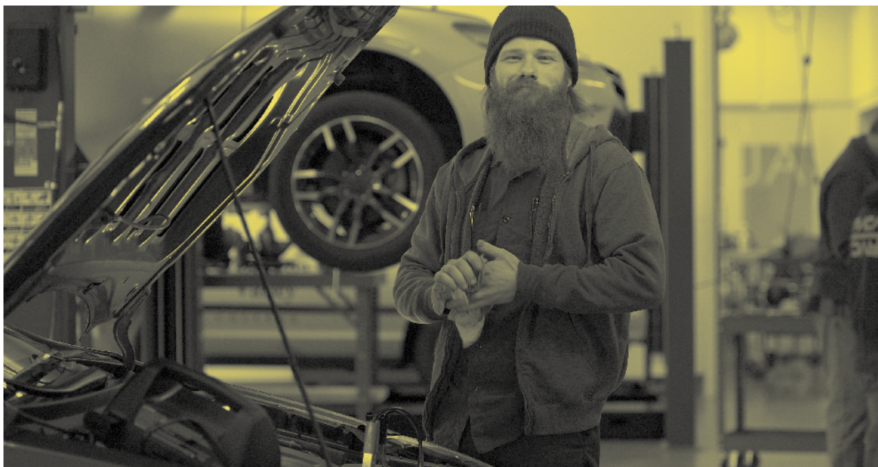
Catawba Valley Community College | Hickory, North Carolina