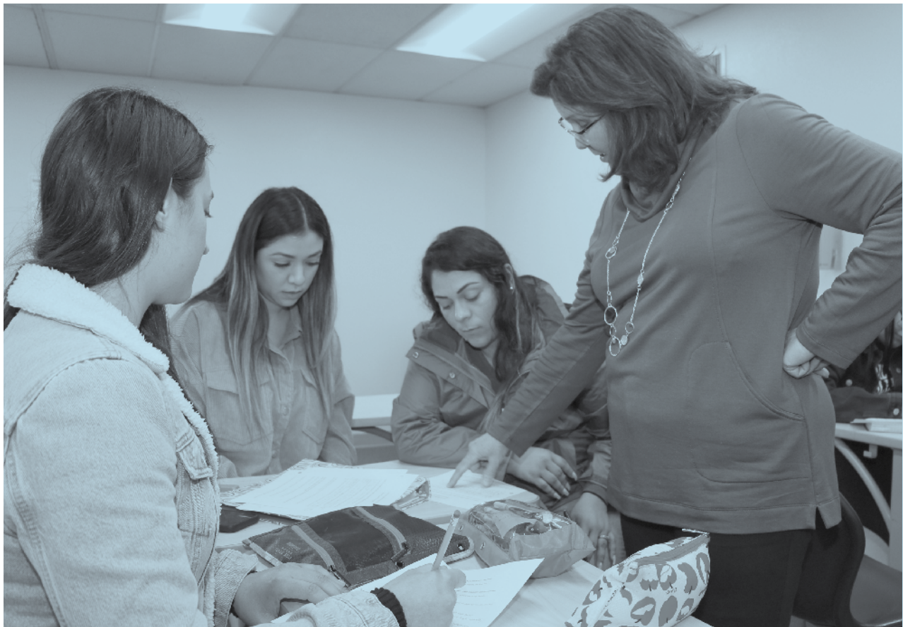
Imperial Valley College | Imperial, California

In Kentucky, a partnership between West Kentucky Community and Technical College and a four-year university program is helping ease a shortage of mental health providers in the community. Lindsey Wilson College's School of Professional Counseling (LWC), a four-year university program that trains licensed counselors across Appalachia, rents space on West Kentucky's campus, where it delivers upper-division courses to West Kentucky students, taught by a combination of adjunct faculty based in the community and full-time faculty who commute. LWC employs an onsite enrollment coordinator, who helps students navigate transfer, registration, and financial aid. West Kentucky students who graduate from LWC have a clear pathway to a counseling career, and their communities receive trained mental health professionals. An added benefit: Some transfer graduates remain in the local area and provide mental health support to students.