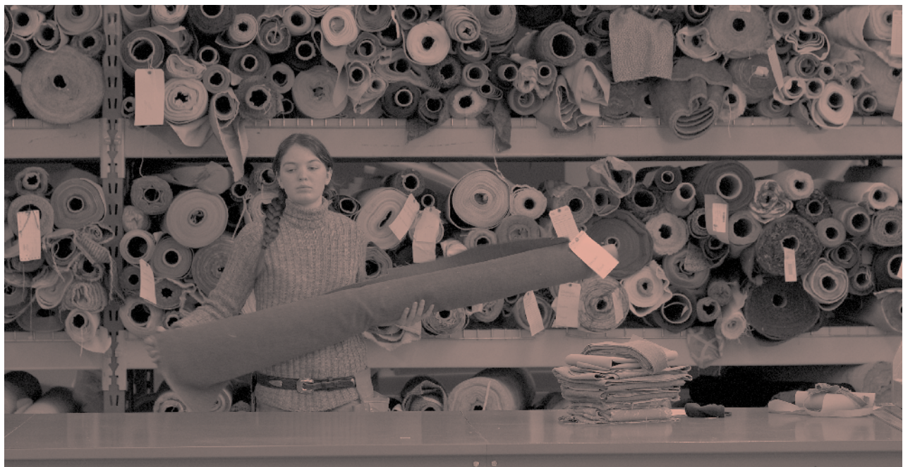
Catawba Valley Community College | Hickory, North Carolina

A similar opportunity is available to students at Northwest Iowa Community College , which is at least three and a half hours away from all three Iowa public universities. To expand educational access to rural Iowans, the universities created four Western Iowa Regents Resource Centers that provide online access to bachelor's degrees, including for community college transfer students. The resource center in Sioux City partners with Northwest Iowa to help fund a staff member who makes sure students can earn a bachelor's degree online while still accessing the strong student services at the resource center.