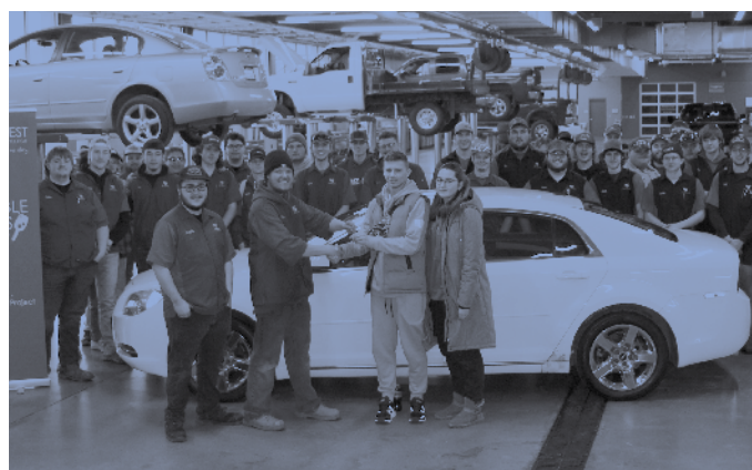
Northwest Iowa Community College | Sheldon, Iowa

Northwest Iowa also belongs to college partnerships that expand students' access to online courses and aid in their success. One consortium—called the Iowa Community College Online Consortium (ICCOC)—enables Northwest Iowa and its partners to jointly offer courses that each individual college either wouldn't be able to fill alone or would struggle to hire faculty to teach. Another consortium of nine community colleges across Iowa and Illinois enabled Northwest Iowa to purchase Dropout Detective, software that supports advising and an early alert system the college uses to target support for students struggling in online courses. Northwest Iowa pays a small additional amount to use the technology to support in-person courses. The college takes a similar approach to jointly fund its student information system. Instead of purchasing a lower-performing system, the college participates in consortium pricing, which has enabled it to secure a much more sophisticated student information system than it could afford on its own.