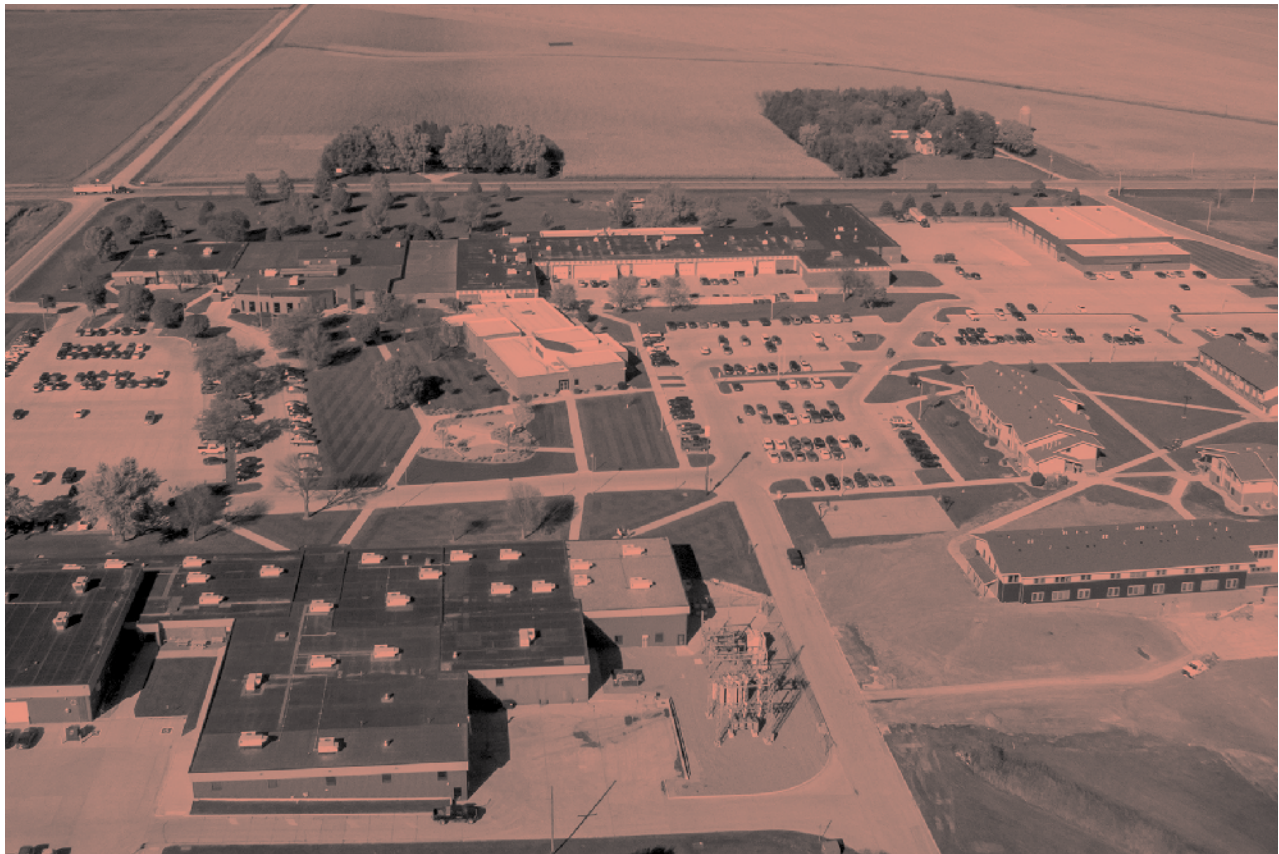
Northwest Iowa Community College | Sheldon, Iowa

We are inspired by the examples of community colleges in this guide, and we hope other rural colleges will use them to ensure that more of our nation’s diverse rural residents enjoy fulfilling careers and develop their talents in ways that strengthen rural communities and economies.