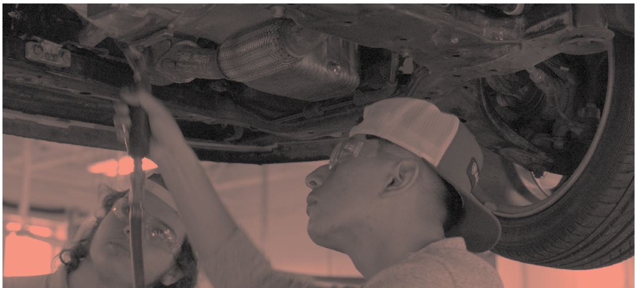
Catawba Valley Community College | Hickory, North Carolina

Rural community colleges often have challenges recruiting and retaining staff and faculty. Many community colleges researched for this guide cited particular challenges hiring for positions that require technical skills in high demand, such as faculty and staff with information technology or institutional research expertise. As noted earlier, part of the challenge is that rural colleges don't have equal financial resources to compete with other colleges for essential personnel. Another factor: Rural college leaders we interviewed reported hesitancy among candidates to move to a rural area unless they have a prior connection to the place. Finally, limited housing availability—either because of rising costs in rural communities with tourist attractions or low supply—makes faculty and staff recruitment even more difficult. These recruitment challenges mean rural community colleges must devise creative solutions, such as building housing for faculty and staff, sharing services with other community colleges, and combining roles in ways that increase efficiency and effectiveness.