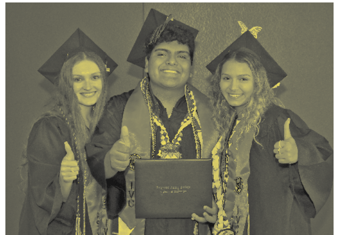
Imperial Valley College | Imperial, California

Another rural community college that has established strong dual enrollment pathways: Imperial Valley College in a rural part of Southern California near the Mexico border. The college has developed a deep relationship with its K-12 system, providing students dual enrollment courses alongside robust guidance on college. Instead of waiting until students graduate, Imperial Valley College advising staff go into high schools to help students complete financial aid applications, choose a program of study, and understand what preparatory work they need to complete an associate degree. As a result of the college's efforts, many students leave high school with an educational plan, developed with the help of high school advisors (rather than solely through staff on the community college payroll). The percentage of high school graduates who go on to enroll at Imperial Valley is much higher than at other community colleges, ranging from 60 percent to 88 percent, depending on the high school. And those students persist: The increases in high school advising and financial aid support provided to high school students have coincided with a steadily increasing completion rate at Imperial Valley for the area's high school graduates.