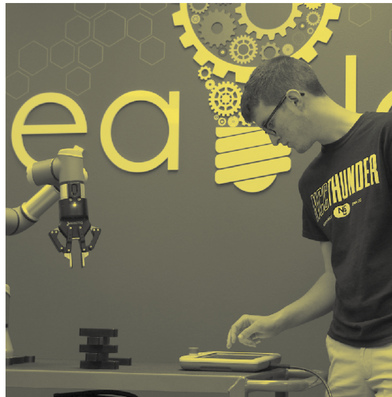
Northwest Iowa Community College | Sheldon, Iowa

We hope the examples of excellence featured in this report provide inspiration for community colleges across the country and ideas about how to apply their assets to the critical goal of strengthening the lives of rural community college students and entire rural communities. We look forward to seeing how the lessons offered by these college fuel further rural community college excellence.