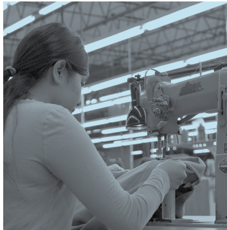
Catawba Valley Community College | Hickory, North Carolina

This was an improvement from the past, when Zane State success coaches relied on students coming to them with challenges or faculty flagging concerns. College leaders now expect success coaches to proactively contact the students who are at the highest risk of not persisting, and to alert the faculty teaching these students so they can reach out, too. This intentional approach to advising has contributed to the college's rapid increase in three-year completion rates from 34 percent for the 2012 cohort of first-time, full-time students to 54 percent four years later. 49