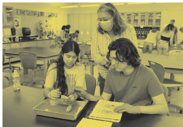
Imperial Valley College | Imperial, California

areas live in poverty (over 14 percent, compared to 11 percent in metropolitan areas), the pull to choose employment over higher education may affect a higher proportion of potential students in rural communities. 21 Second, completing a credential of value is far from certain. Most community college starters (60 percent) do not earn any credential in six years, and outcomes for students of color are lower. 22 Finally, outcomes for those who do complete may discourage some prospective students. According to the Community College Research Center (CCRC), only about a quarter (23 percent) of associate degree graduates and a little more than a third (37 percent) of occupational certificate holders completed programs associated with earnings of at least $35,000 two years after completion. 23