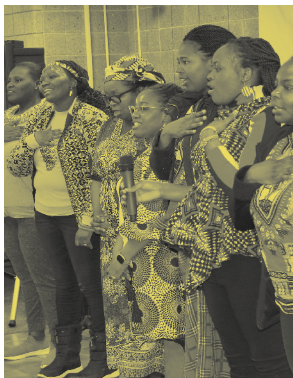
Northwest Iowa Community College | Sheldon, Iowa

Leaders of excellent rural community colleges often cited the resilient, innovative, and adaptive spirit in their communities, which, at their colleges, translates into a pervasive desire to improve outcomes for both students and, more broadly, residents of their communities. Many rural communities have weathered changing economic conditions, public health crises, and population declines. As this research demonstrates, excellent rural community colleges have achieved success for students despite having fewer and more dispersed resources than most urban colleges. Through employer, university, and other community partnerships, as well as creative human capital strategies, these colleges strategically utilize the resources of their communities to advance their missions.