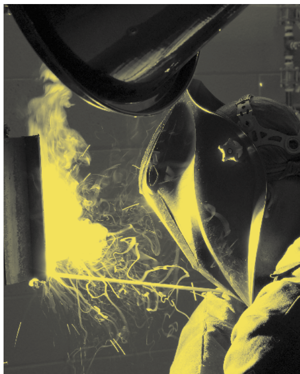
Patrick & Henry Community College | Martinsville, Virginia

Partnering with industry leaders can also create opportunities and generate resources for students. For example, Northwest Iowa Community College partnered with SnapOn, a major tool manufacturer, to reduce costs for automotive technology students. Previously, students had to buy tools at the start of the program, which cost thousands of dollars, an amount few could afford. Now, SnapOn provides tools to students for a minimal fee each term, which is then credited to students' purchase of the tools upon program completion. When the college did not have money to hire new instructors for the program, they turned to other companies to fund instructors' salaries for a finite period of time. Once program enrollments were up, the college was able to use tuition revenue to support the entire cost of faculty. The initial boost from industry helped the college scale its program and deliver more skilled workers. These industry partnerships provide many benefits, including free and low-cost program equipment, scholarships for students in credit programs, and unique opportunities for students to be interviewed and hired after graduation.