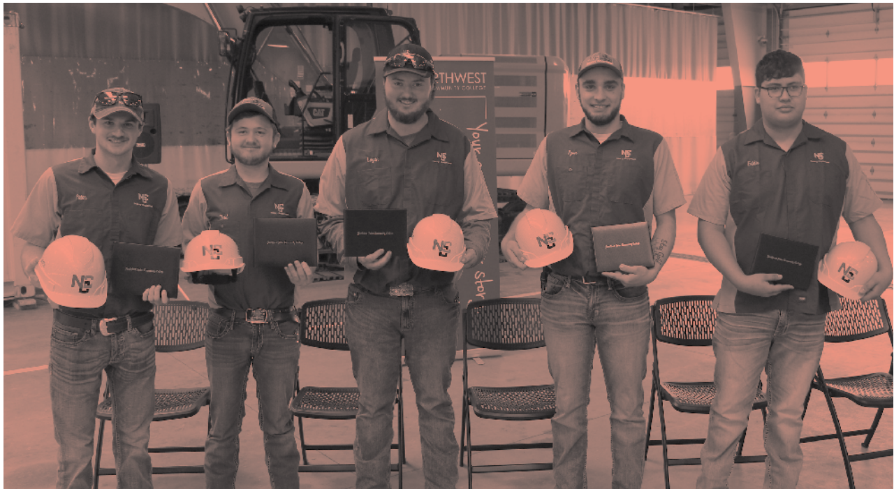
Northwest Iowa Community College | Sheldon, Iowa

When a student is absent, it's obvious, and someone in the class usually knows why, making it possible for the faculty member to reach out and help solve challenges. Faculty report that their intensive advising role makes them better teachers because they understand students' academic and nonacademic needs. As a result of these and other efforts, Lake Area Tech boasts an impressive 76 percent three-year graduation and transfer rate, 30 percentage points higher than the national average.