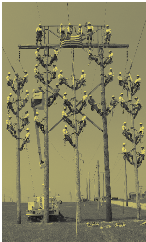
Northwest Iowa Community College

Their strategy and hard work paid off. Within a decade, Walla Walla had more than 170 wineries in operation and is now a wine-tourist destination. That growth spurred additional development in wine distribution as well as the food and hospitality industries, which led to new programs at the college and new job opportunities for graduates.