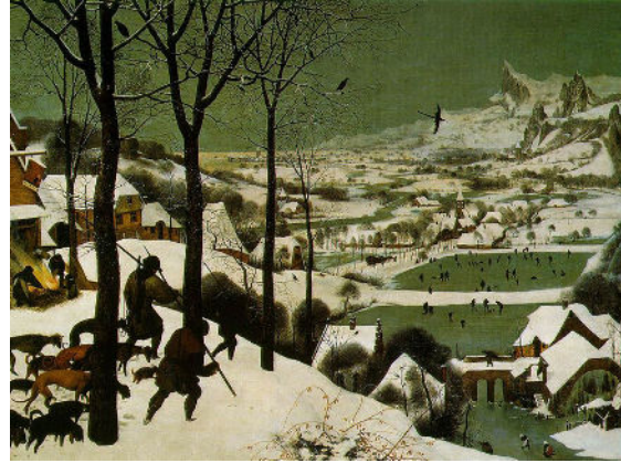
Hunters in the Snow by Pieter Bruegel the Elder 1565

Our best hope of averting catastrophic climate change, an extended period of deprivation and die-off that would surely be the greatest catastrophe in human history, may be found in a centuries-long event that ranks as the greatest catastrophe in human history to date.