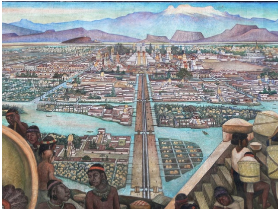
Pre-Columbian Mexico City (Tenochtitlan)